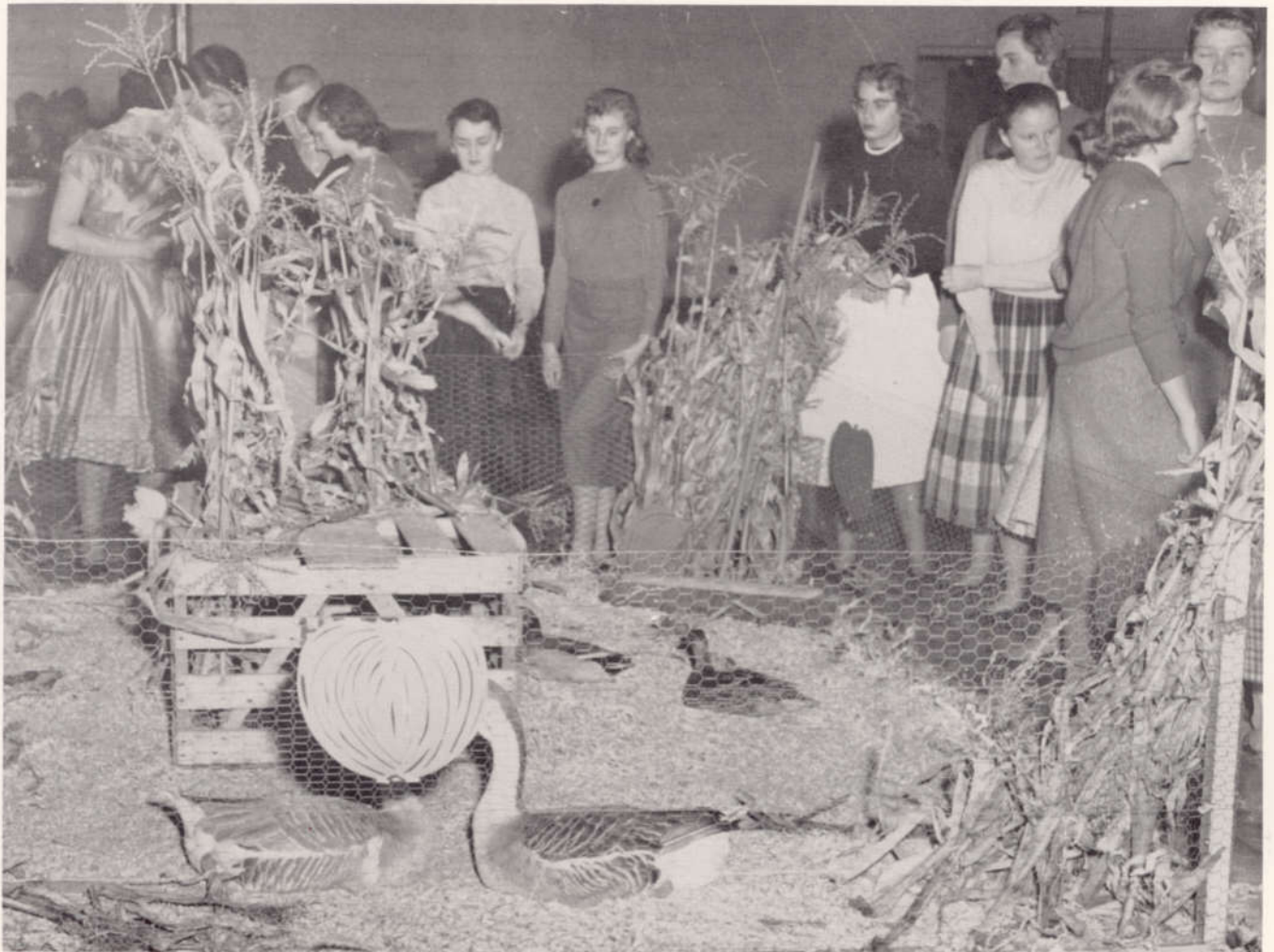
The imaginative members of the Lyceum Club show their originality in this appropriate setting at the Turkey Trot.