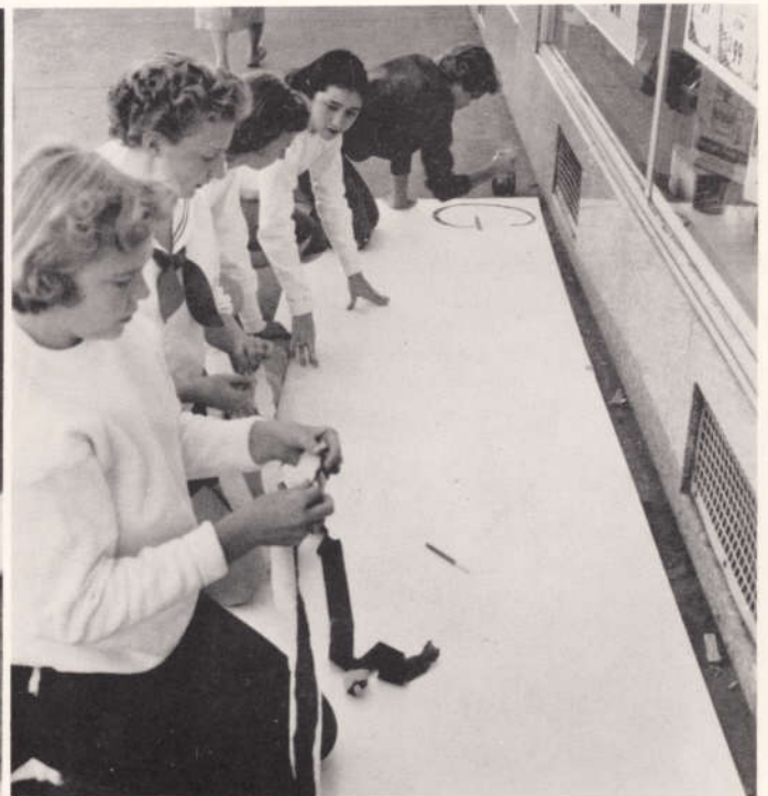
Decorating for the big homecoming game are the above senior girls.