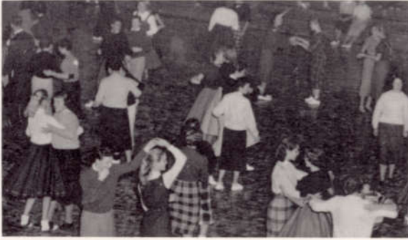
This panorama is typical of the many dances held throughout the year in the new gymnasium of Memorial High School.