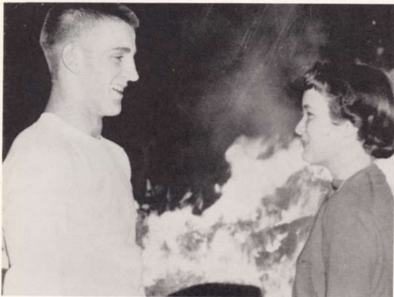
At the Thursday night bonfire, first of the Homecoming events, this surprise couple was announced to reign over the Pow Wow weekend.