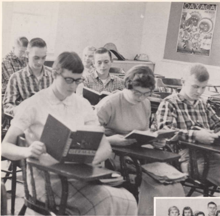
Students in German class practice reciting the German language with the help of their books.