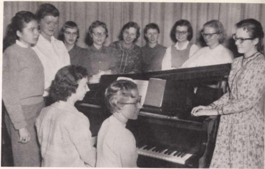
Practicing for the annual Christmas Carol Sing is one of the more pleasant tasks undertaken by the girl reserves cabinet members during the Christmas season.