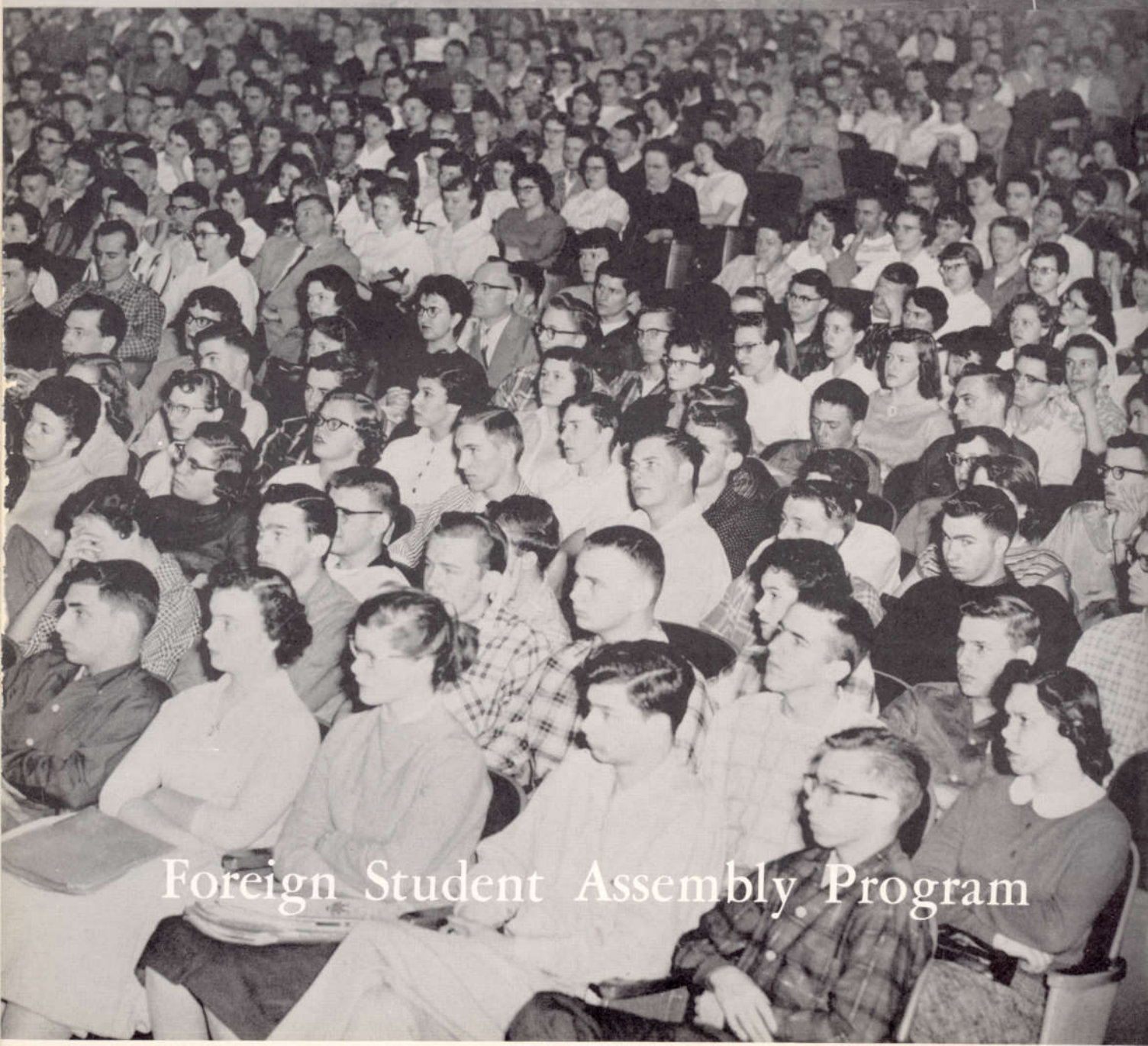
Foreign Student Assembly Program