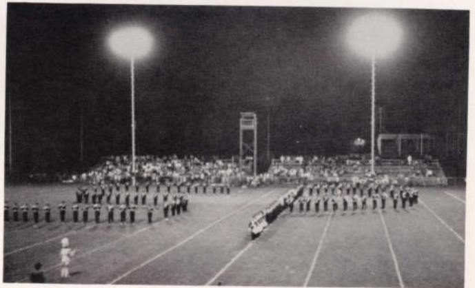
The Marching Band performed many clever maneuvers during football half-time.

Expert direction and excellent facilities equal the best band in the area. Participating in many high school and public activities and sectional practice, keeps the band members busy. The annual concerts with the traditional and stirring "Stars and Stripes" as a climax, thrill every audience.