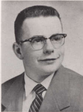
Oscar Peterson "Osc"