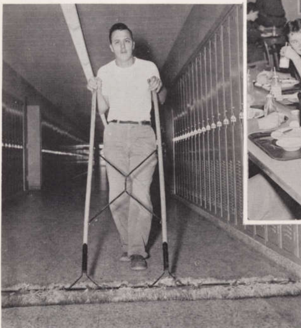
An ant's eye view of a daily sweeping.