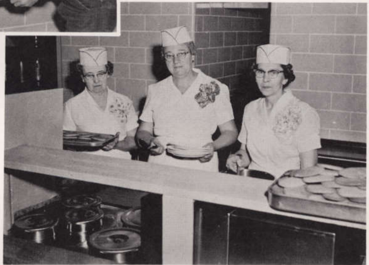
We'll serve you.

A school day begins and ends with the ever present custodian performing the task of keeping our building spotless and in repair.