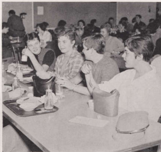
Feeding the multitude.