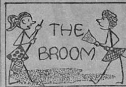
"We Sweep Up All the Dirt"

Eye for now, but don't forget to attend the Sno-Ball Dance sponsored by the NEWS and KODAK.