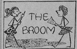
"We Sweep Up All the Dirt"

Our school has been very successful in the contests in which they have competed. Awards were won at contests held in St. Paul and Madison in addition to the new honors received at the state meet in Milwaukee.