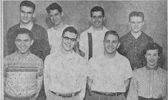
1956 Badger State Representatives