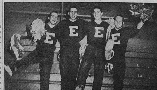
Senior Cheerleaders (?)