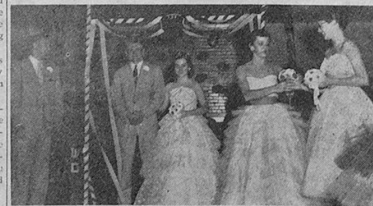
Royalty at 1956 Pigskin Pow-Wow