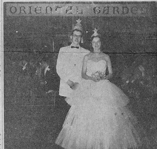
Junior Prom King and Queen